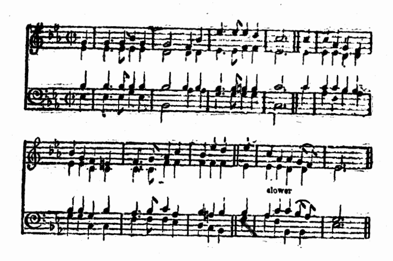
Tune 61 in S.S. Hymn Book.

We come, O Lord, to bless Thee, Within our Sunday School; Our hearts are light, our faces bright, And as in worship we unite, Love is our golden rule.